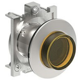
Illuminated button actuators, spring return - Extended LPFBL20