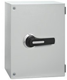
Enclosed changeover switch GLZM