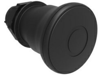
Mushroom head pushbutton, Latch, pull to release Ø 40mm/1.6" LPCB674