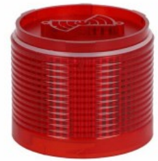
Signal tower Ø70mm/2.75" LTN70