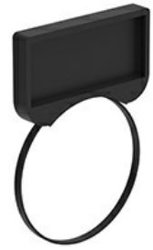
Label holder for engraved plastic LPX AU109 label LPXAU100