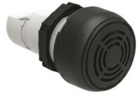
Monoblock buzzer - Continuous or pulse tone LPCZS