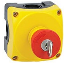
Yellow control station LPZP1A5 complete with mushroom pushbutton turn-key-to-release LPCB6844 1NO+1NC LPZP1B5607