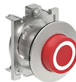
Pushbutton actuators, spring return, with symbol LPFB21