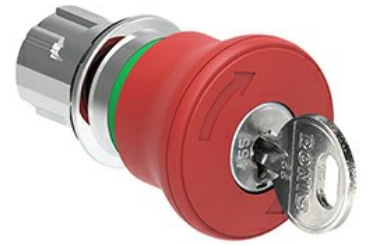
Mushroom head pushbutton, Latch, turn key to release Ø 40mm/1.6" LPSB684