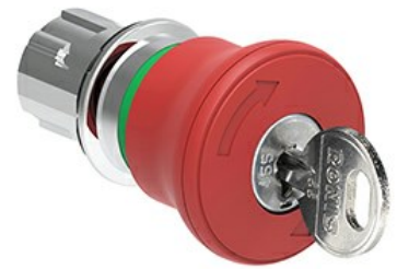
Mushroom head pushbutton, Latch, turn key to release Ø 40mm/1.6" LPSB684