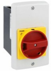
Flush mount enclosures IP65 for SM1R (UL type 4X) SM1Z Flush mount enclosures IP65 for SM1R (UL type 4X) SM1R...