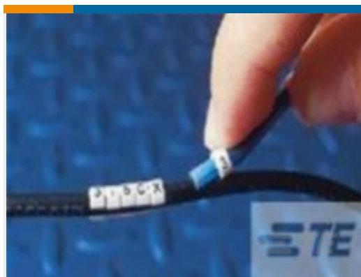
TE Part # 1SET511177R0000 SO-Marker-03-300-A-WH