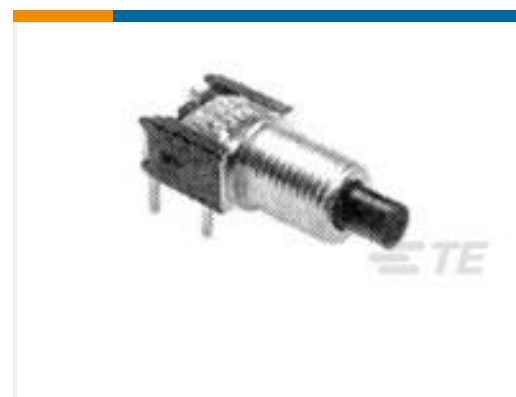
TE Part #1825100-4 TPF11CGRA004