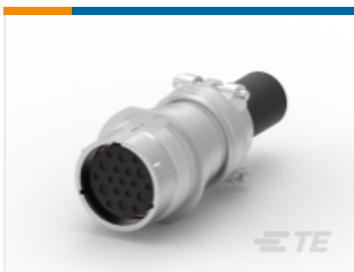
TE Part #HD34-24-19SE-059 REC,19P,AL,E,CBLCLMP BT,DRAIN,12 /16,S,MC