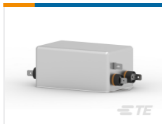
TE Part #2-6609037-6 12EP1=F8217