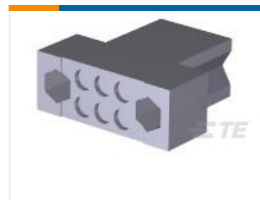
TE Part #202757-1 6 POS. FEM. BLOCK