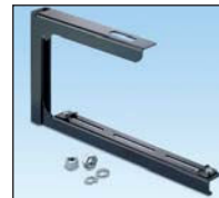
FR12ACB12 FR12ACB58 FR12ACB12M FR12ACB58M