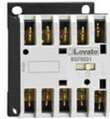
Auxiliary contactor BGF00