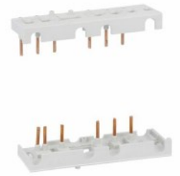
3P Rigid connecting kits for BF09...BF25 BFX3101