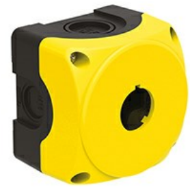
Plastic control station without actuators - for 1 actuators LPZP1A5