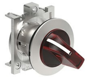
Illuminated selector switch actuator - 3 position LPFSL13