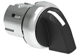
Selector switch actuators lever - 3 position LPSS13