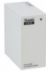
Level control relay for emptying function. Single voltage. Plug-in version LV1E Emptying