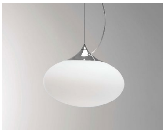
CODE: 1176002 FINISH: POLISHED CHROME

TO MAINTAIN THIS PRODUCT TO ITS BEST CONDITION, PLEASE VIEW OUR CARE AND CLEANING GUIDE ON THE SUPPORT SECTION OF THE ASTRO WEBSITE.