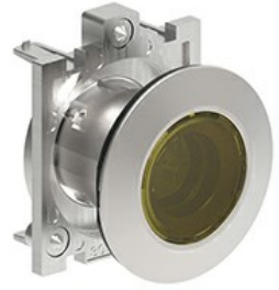
Illuminated push-push button actuators - Flush LPFQL10