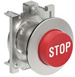
Pushbutton actuators, spring return, with symbol LPFB21