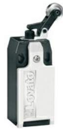
Roller side push lever KMD