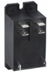
INDUSTRIAL RELAYS ATEX HR8020