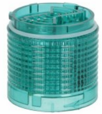
Signal tower Ø50mm/1.97" LTN50