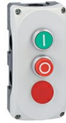
Grey control station LPZP3A8 complete with green flush pushbutton "i" LPCB1113 1NO, red extended pushbutton "o" LPCB2104 1NC and red pilot light 24V LPZP3B8901