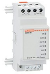
Expansion modules for modular products - inputs/outputs EXM1000