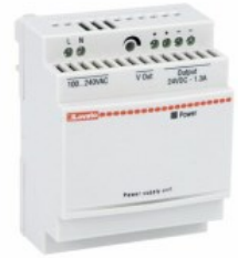
Power supply unit 100... 240VAC/24VDC 1.3A LRX1V3D024