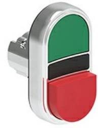
Double-touch actuators, spring return - One extended and one flush pushbuttons LPSB72