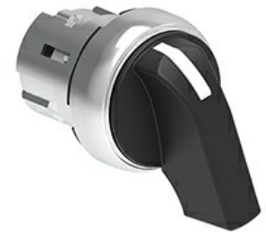
Selector switch actuators long lever - 3 position LPSS23