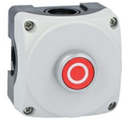
Grey control station LPZP1A8 complete with red flush pushbutton "o" LPCB1104 1NC LPZP1B8102