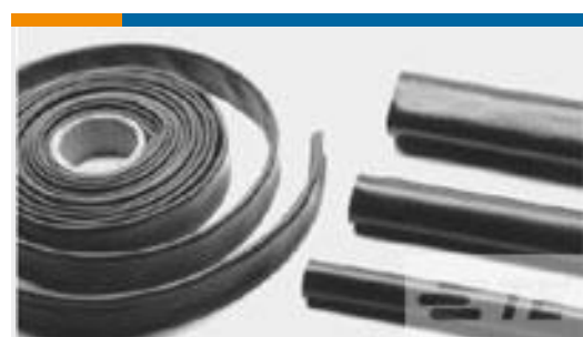
TE Part #CB5015-000 BSTS-07X4