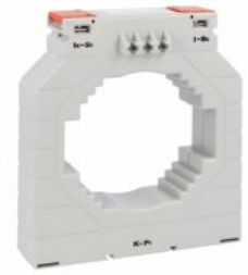
Current transformers DM4T3000 Solid-core