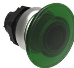
Illuminated mushroom head button actuators - Spring return Ø 40mm/1.6" LPCBL61