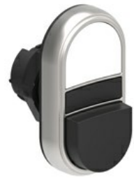
Double-touch actuators, spring return - One extended and one flush pushbuttons LPCB72