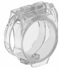
Protection cover for Ø22mm/ 5 0.015 0.87" push- buttons LPXAU170