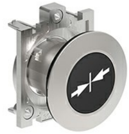
Pushbutton actuators, spring return, with symbol LPFB15