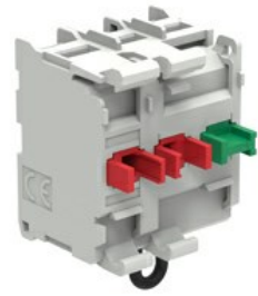
Contact elements - without mounting adapter LPXC