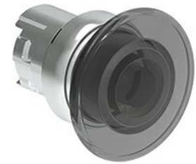
Illuminated mushroom head button actuators - Spring return Ø 40mm/1.6" LPSBL61