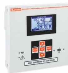
Automatic mains failure gen-set controllers RGK601