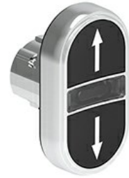
Double-touch actuators, spring return white indicator - Two flush pushbuttons LPSBL71