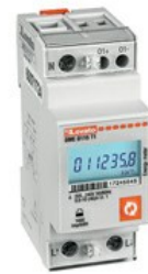
Single-phase energy meters DMED115T1 single-phase 2