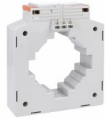
Current transformers DM5TP2000 Solid-core