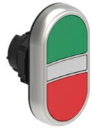
Double-touch actuators, spring return white indicator - Two flush pushbuttons LPCBL71