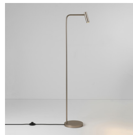
CODE: 1058058 FINISH: MATT NICKEL