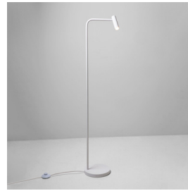
CODE: 1058002 FINISH: MATT WHITE