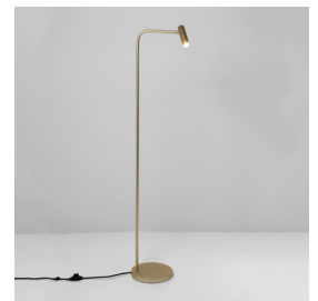
CODE: 1058107 FINISH: MATT GOLD

TO MAINTAIN THIS PRODUCT TO ITS BEST CONDITION, PLEASE VIEW OUR CARE AND CLEANING GUIDE ON THE SUPPORT SECTION OF THE ASTRO WEBSITE.