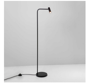
CODE: 1058003 FINISH: MATT BLACK