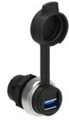
USB interface, A/B female type connection LPCD0