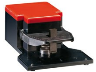
One pedal, with safety lever - open KG110