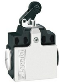
Roller centre push lever KCC