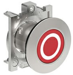
Pushbutton actuators, spring return, with symbol LPFB11