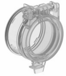
Protection cover for Ø22mm/ 5 0.015 0.87" communication interfaces LPCD... LPXAU171